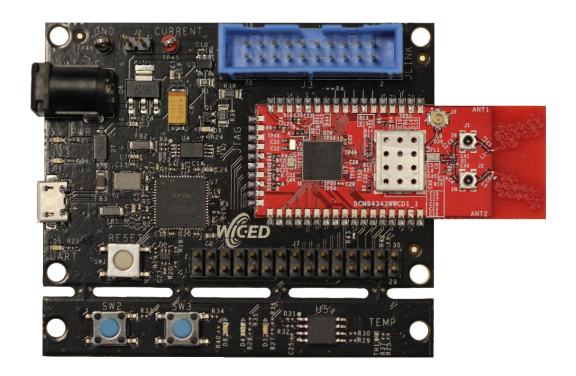
The BCM94343WWCD1 SIP module mounted on a full-featured BCM94343WWCD1_EVB evaluation board.