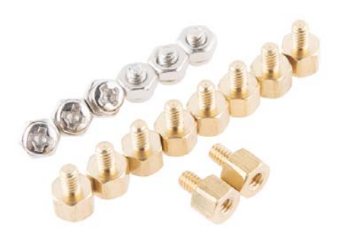
Intel Edison Hardware Pack

The power switch connects power to the stack. When off, the battery is disconnected from the stack but is still capable of charging. You can charge the battery while the switch is on. Can't get much simpler than that!