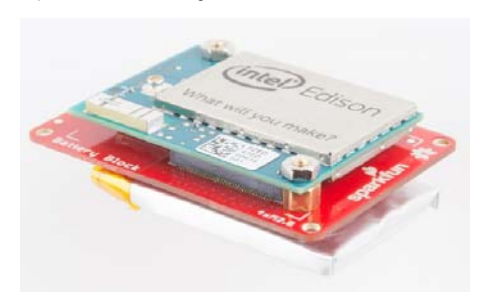
Battery Block Installed

The Battery Block is very simple to use. You can mount the Edison module securely using our Hardware Pack. Note: It may be necessary to gently remove the battery to allow clearance for screws. It's only necessary to do this if the Battery Block is the only Block in a stack.